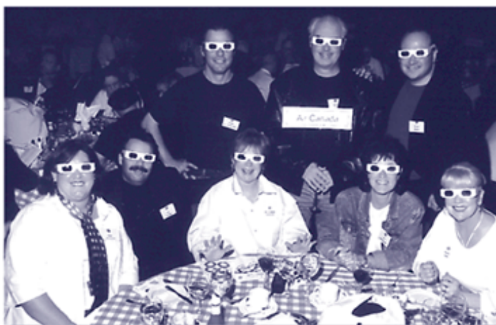
Groovin' with the Air Canada table

The third annual Premier's Roast was held on October 3rd. “Ralph's Rock ‘n Roll Roast” drew 600 attendees and raised more than $90,000 for the Calgary Homeless Foundation.