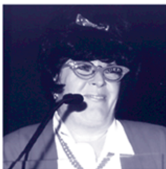
Canadian Alliance MP, Deborah Grey