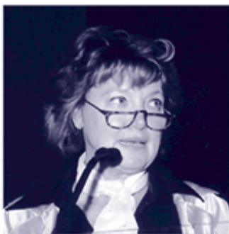
Financial Post columnist, Diane Francis