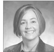
Druh Farrell Alderman Ward 7, City of Calgary