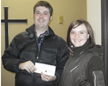
CUPS Rapid Exit Team

“Rapid Exit has successfully housed 29 families experiencing homelessness to date. That is 96 individuals, 61 of them children placed into housing with supports.”